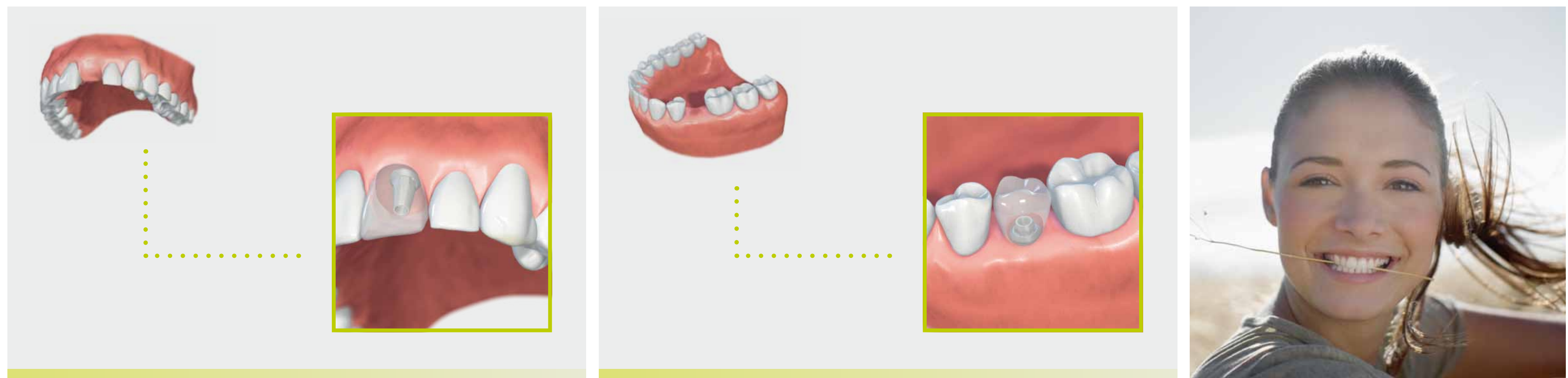
Replacement of an individual tooth in the front or side region with a dental implant.