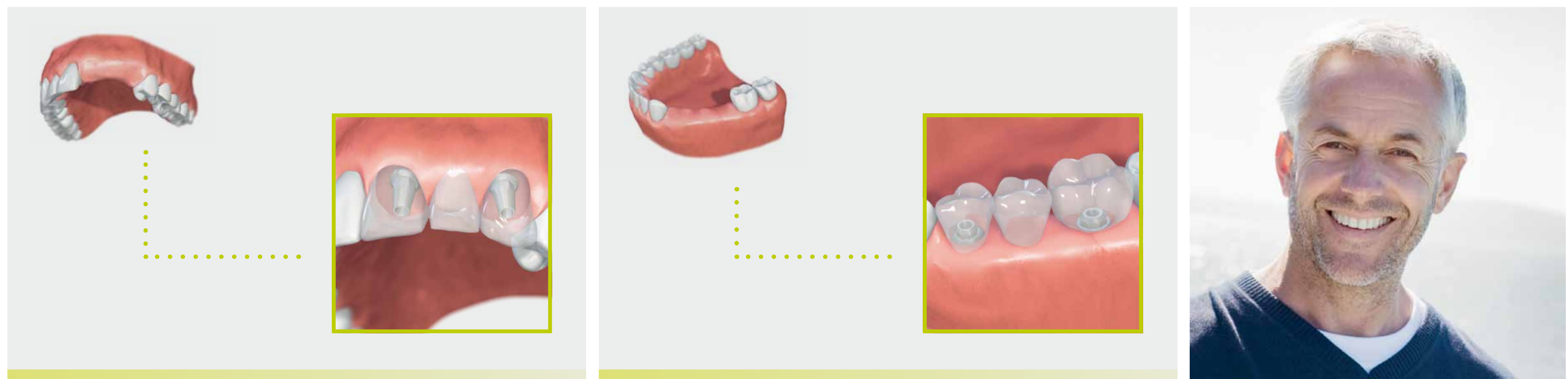
Replacement of several teeth in the front or side region using dental implants.